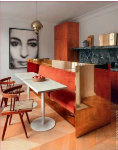
Bring the autumn leaves inside with kids 'Autumn' Travertine marble tile by Sebastiano Zito