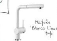
Hafele 'Blanco Linus' tap