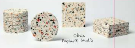
Olivia Aspinall Studio